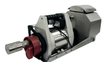
Oserix Dual 120

Pipeline dimensions are dependent on X-Ray generator