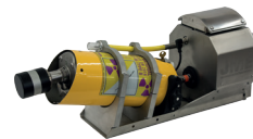
SENTINEL™ Delta 880