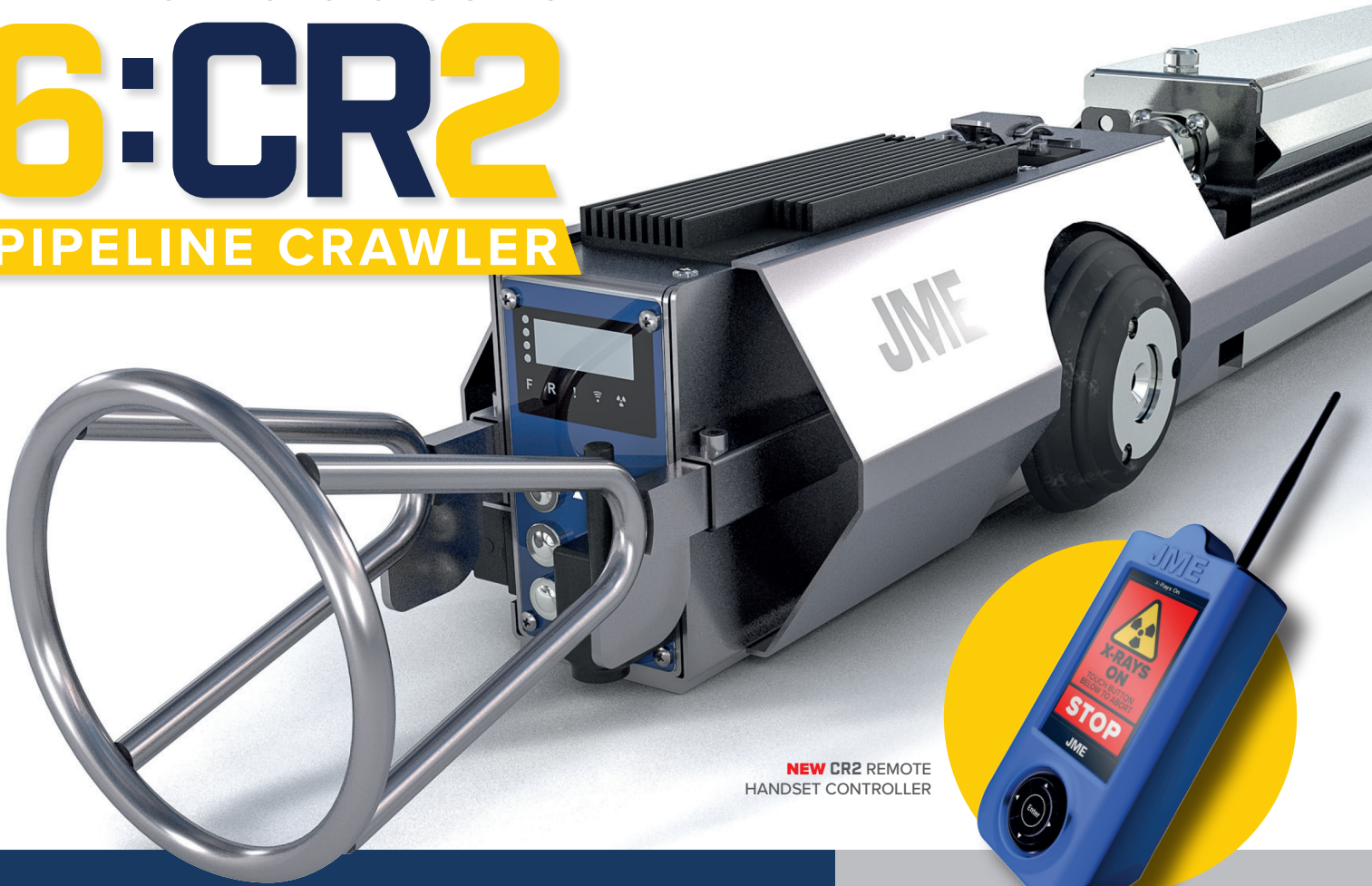
NEW CR2 REMOTE HANDSET CONTROLLER