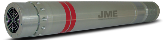
JME CXT 180