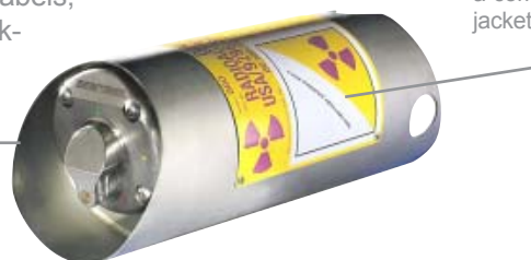
The exposure device, alone, continues to be a compliant Type B package even if the jacket has been removed