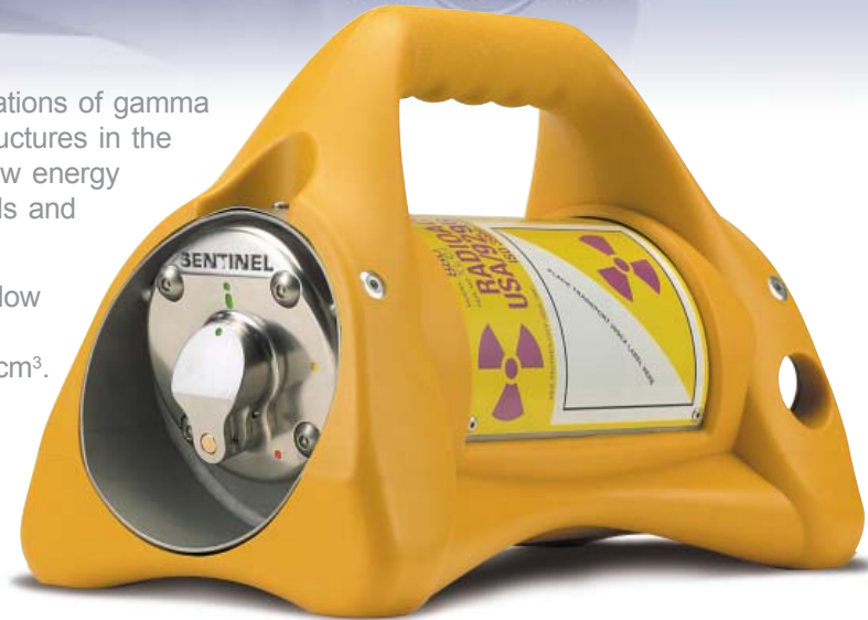
Comfortable carrying handle with slip-resistant contoured grip